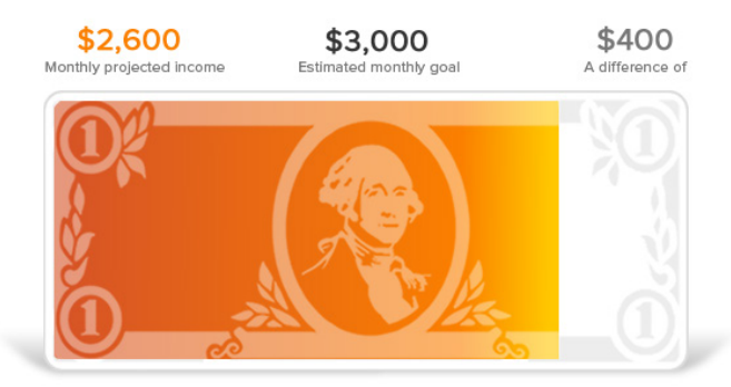
Voya's myOrangeMoney tool

For more information on the myOrangeMoney tool, including a brief tutorial visit the Educational Opportunities page of opers.org.